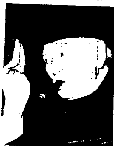
Winston Churchill... "the salami method"